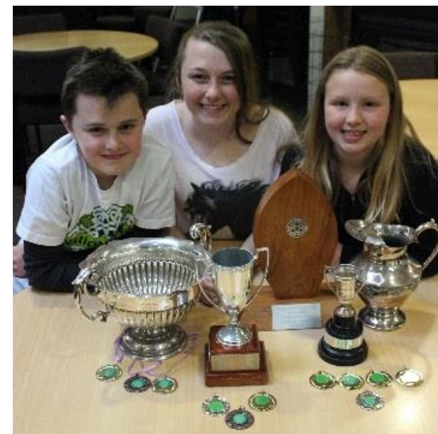
Three of our young Orators with their trophies from 2014